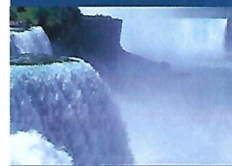
World's most famous Falls