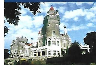
Magnificent Casa Loma Castle in Toronto