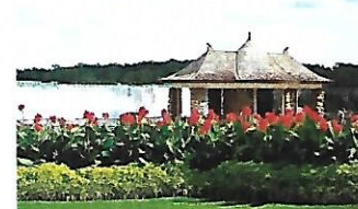
Visit beautiful Queen Victoria Park

Departure: Mary Esther, FL @ 8 am, then Pensacola, FL @ 9 am