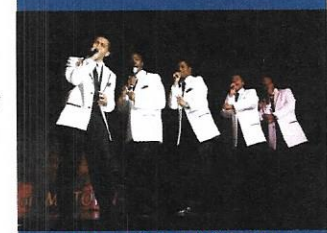
SOUL OF MOTOWN