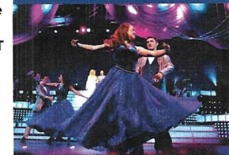
SMOKY MOUNTAIN OPRY

Departure: Mary Esther, FL @ 8 am, then Pensacola, FL @ 9 am