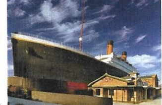
TITANIC: THE WORLD'S LARGEST MUSEUM ATTRACTION