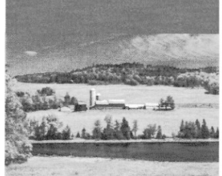
Beautiful Vermont Scenery

Departure: Mary Esther, FL @ 8 am, then Pensacola, FL @ 9 am