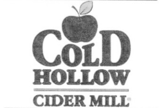
Cold Hollow Cider Mill