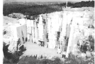
Rock of Ages Granite Quarry