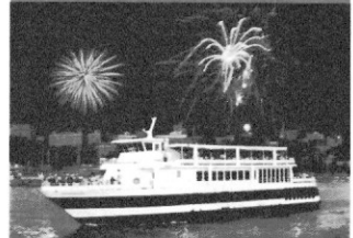
Dinner Cruise on beautiful Lake Champlain