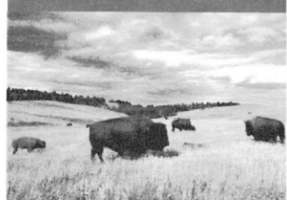
Wildlife enhances the pristine Black Hills