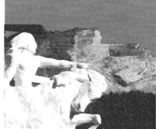
Crazy Horse Monument to be 10x the size of Mt. Rushmore