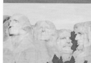
U.S. Presidents immortalized in stone at Mt. Rushmore

Diamond Tours ® inc. Bringing Group Travel to a Higher Standard ®