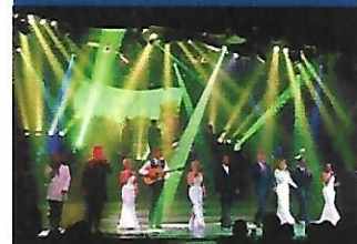
Fabulous Carolina Opry