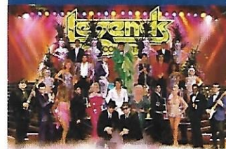
Exciting Legends in Concert